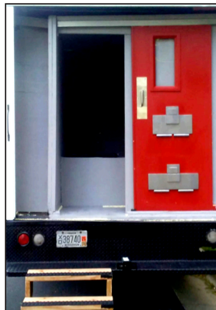
Solitary Confinement Truck