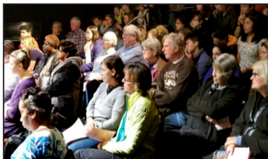
Audience watches "Like an Animal in a Cage"