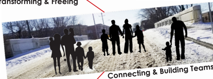
Connecting & Building Teams

Lake Edge Lutheran Church 4032 Monona Drive • Madison, WI • 53716