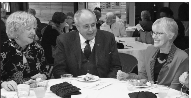
Above: MOSES members and friends enjoy the evening