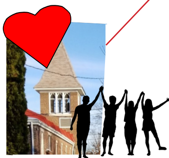
Caring & Changing