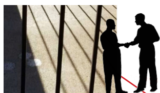
Transforming & Freeing