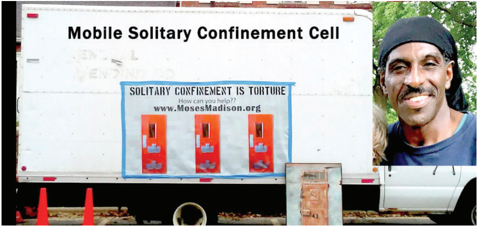
Above: Mobile solitary confinement cell and Talib Akbar