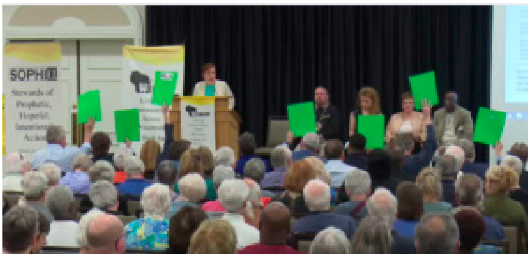
Candidates hold up cards at forum